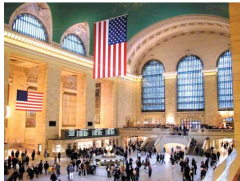
Grand Central Terminal

In 1997, a $175 million restoration project was completed. As part of the restoration, the GCT concourses now lead to the "trainshed," one of the largest underground structures in Manhattan, consisting of 30 platforms on two levels.